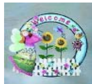
Go Shop icon on web site