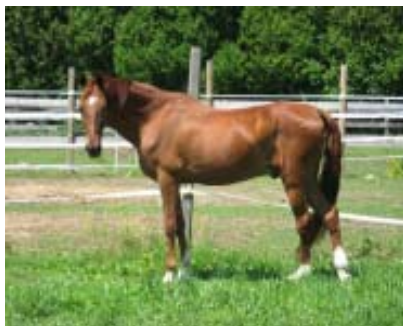
Caeser needs a home!

Caeser is approximately 26 years old and was part of a larger rescue that occurred many years ago in New York.